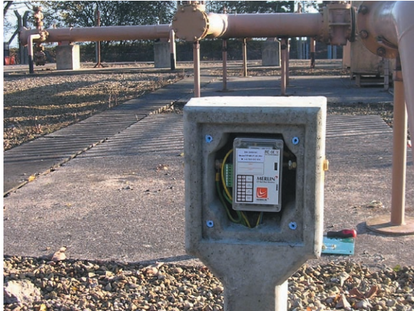
Figure 3. CP test post monitor.

The integrity team liaises with statutory bodies (Health and Safety Executive, Local Authorities, etc.) on safety, control of accident hazards, inspection and maintenance issues. This includes cathodic protection compliance, where United Utilities works to Northern Gas Networks' policy and procedures for CP monitoring and maintenance.