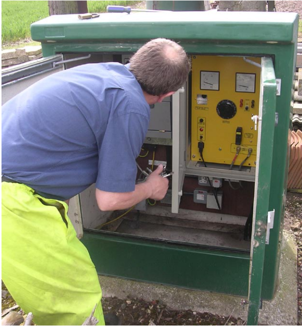
Figure 4. Manual TR checks are labour intensive.