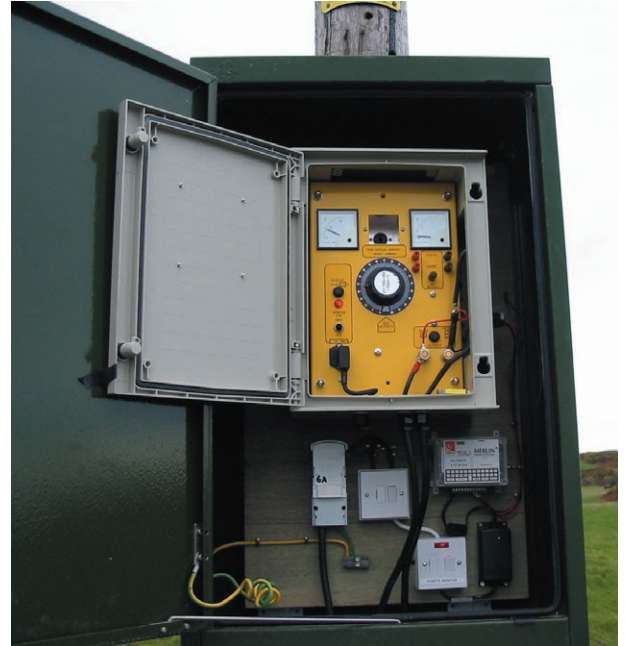
Figure 5. Monitoring a transformer rectifier remotely.

Safety was another important factor. Many T/Rs are located on busy roadsides or at relatively inaccessible locations, posing additional risks to lone-working