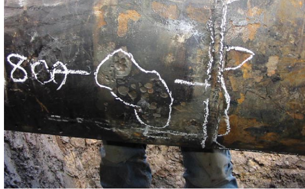
Figure 2. Pipeline corrosion. Coating (left); weld (right).